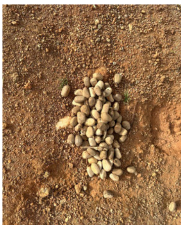
Figure 17 - Seeds are dried

The cleaning of Encephalartos seeds is exceptionally tedious due to their intricate structure. However, this meticulous task was undertaken with great enthusiasm by the women (figure 16) who received training in seed processing. Despite the challenges, they approached the work with dedication. Additionally, the drying process (figure 17) was carried out using traditional methods, preserving the seeds in a manner that has been passed down through generations. This blend of traditional knowledge and modern conservation practices highlights the collaborative and adaptive approach taken towards safeguarding the future of Encephalartos species.