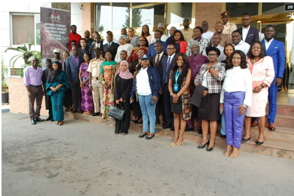
Figure 1 -CITES Forum Abuja 6/10/2023

Technical staff have also given their time for training sessions.