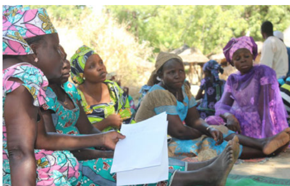
Figure 10 - Training seeds collection

The training course led by WAECINIT took place during the 1st week of June. The training was well received by all the participants. (12 trainees: 8 women – 4 men). Trainees were shown how to collect E.barteri ssp Allochrous at the right stage of seed maturity, had training on the best techniques for cleaning seeds and learnt about different types of strategies for their conservation.