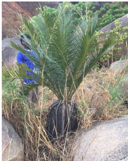
Figure 7 - Participatory mapping

In November and December 2023 Crescendo conducted participatory mapping with the members of the village which gave the PI. Informations captured gave important data relating to landscape use, threats, location of the remaining Encephalartos population in the wild. This collaborative effort not only fostered engagement and trust within the village but also yielded invaluable insights into landscape utilization, prevalent threats, and crucially, the precise locations of the remaining Encephalartos population in the wild. By harnessing the knowledge and perspectives of residents, the participatory mapping exercise facilitated a nuanced understanding of the ecosystem dynamics and conservation challenges. The information gathered served as a cornerstone for the project, guiding subsequent research endeavors and conservation strategies aimed at safeguarding the endangered Encephalartos species and its habitat.