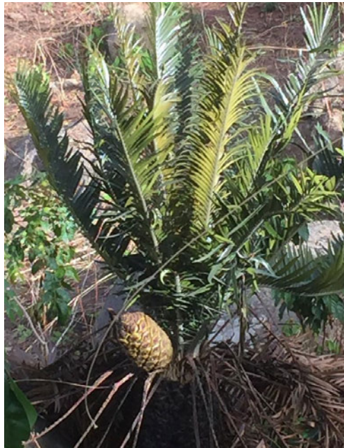
Figure 14 - Cone surveys

One of the challenges of collecting Encephalartos is that the female cone does not produce every year. This survey was therefore crucial for the subsequent collection. By identifying populations of E. barteri ssp Allochrous and assessing their fruiting status, researchers can better anticipate periods of female cone production and optimize seed collecting expeditions. This precise knowledge of the species' reproductive cycles helps minimize the risk of failure and ensures effective and sustainable seed collection, essential for the long-term preservation of this endangered species.