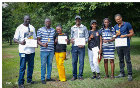
Figure 11 - Training in Ibadan IITA

5 persons received a training in Nursery Management improvement techniques in IITA Ibadan. https://www.iita.org/news-item/conservationists-learn-tree-management-and-propagation-practices-from-iita-forest-center/