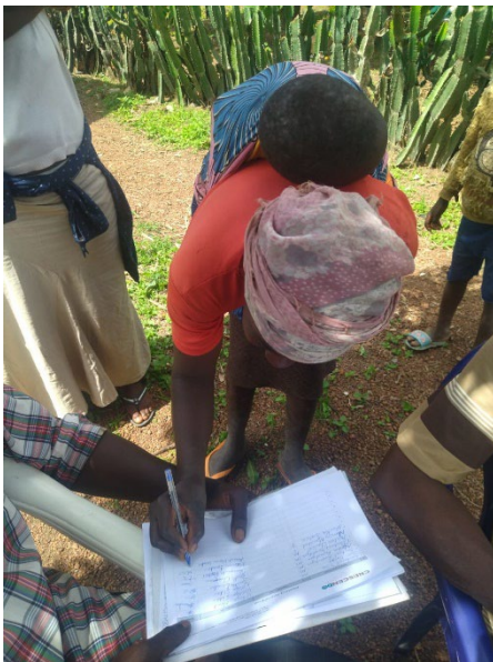
Figure 2- Signature Meeting Attendance

A training course led by a WAECINIT team member was held in July 2023 in Gilling, attended by 15 participants (mostly women) from the Gilling communities. This exceeded the target number of participants within the original log-frame (10 people). A translation in Hausa was provided throughout the training to make the material accessible to all participants.