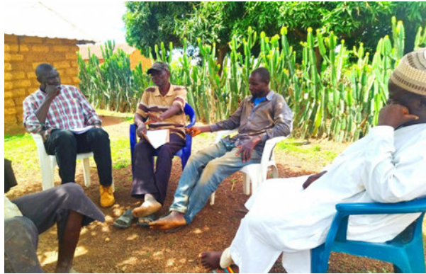
Figure 6- Semi-structured interviews in Gilling

This activity was previously planned to start by the end of September. However, we decide to delay the survey until the beginning of November. The rainy season was so strong in September that many communities were inaccessible as the roads turned into rivers, making surveying impossible.