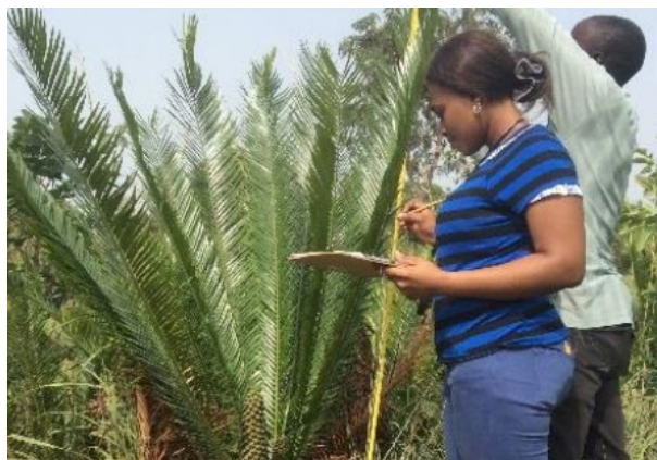
Figure 8 - Habitat surveys

The habitat surveys for E. barteri ssp allochrous involved meticulous sampling techniques aimed at comprehensively understanding the ecosystem. Utilizing 50mx50m plots subdivided into 10mx10m subplots ensured detailed data collection. Within each subplot, various parameters were recorded, including the abundance and sizes of cycad plants, along with identifying associated plant species and analysing soil composition through samples. Notably, the surveys extended beyond ecological aspects to assess anthropogenic impacts, such as the removal of plants for agricultural purposes. Documentation was comprehensive, with digital imagery capturing plant morphology for further analysis. Furthermore, engaging with local communities through interviews and questionnaires enriched the study with ethno botanical and historical insights specific to each village, offering a holistic perspective on the endemic Encephalartos plant within the region.