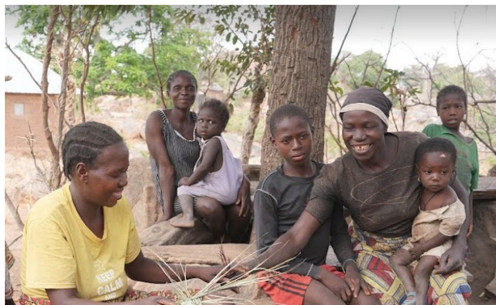
Figure 16 - Seeds are cleaned

Activities 2.7 to 2.10 related to Year 2.