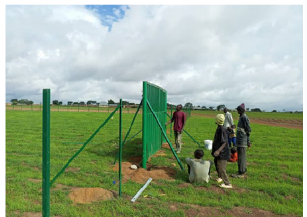
Figure 13 - Nursery under construction