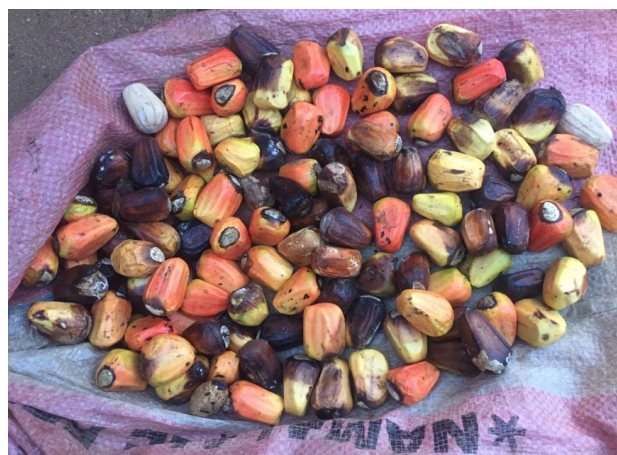
Figure 15 - Seeds collection Fier area

Seeds and data of E. barteri ssp allochrous were collected from multiple areas through about ten expeditions dedicated to seed collection. The terrain posed significant challenges, with rugged paths cutting through highly rocky zones. Despite these obstacles, a group of determined individuals, predominantly youth, ventured into the highest reaches of the mountains for collection purposes. Approximately 500 seeds were harvested from 10 different locations, representing a diverse array of habitats within the species' range. This extensive collection effort secured genetic diversity and contributing to the conservation of E. barteri ssp allochrous.